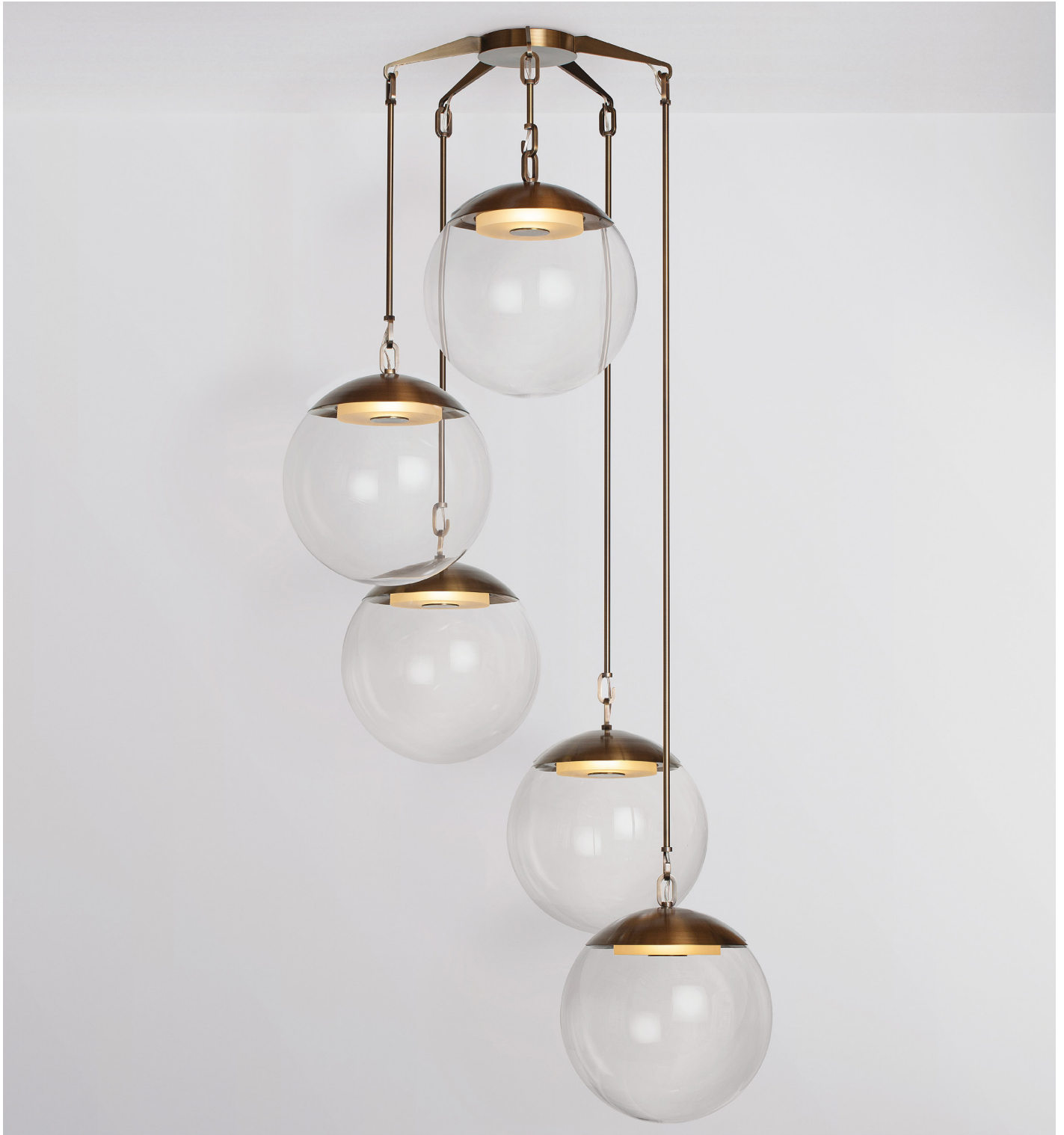
Shown in August Brass with Frosted Solid Glass Light Discs and 16" Diameter Globes